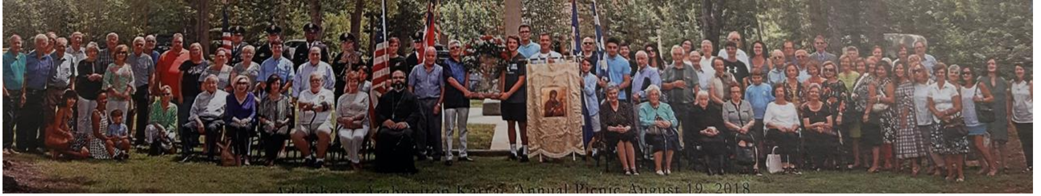
Panoramic photo of the compatriots who gathered at the annual summer celebration at August 19, 2018 ay the Karye Parc in Gastonia N.C.

The pandemic has unfortunately strike the United States hard. Therefore for the first time the annual festival of the older Caryatic Brotherhood did not take place in 2020. However, the Brotherhood's Annual Album 2019 was sent to us, from which we publish a photo from the event of 2018. We wish in 2021 the health situation to be much better so as to our compatriots to be able to gather again and celebrate.